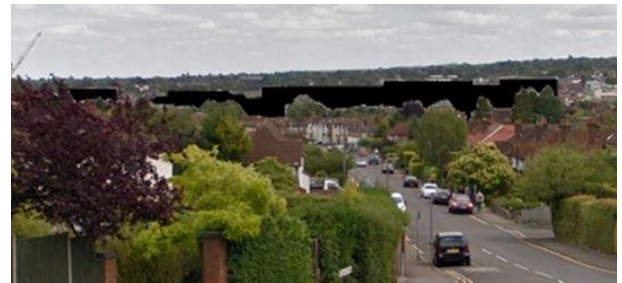
Mass & Height - view from Onslow Village

Imagine it 30% longer and higher. That's what the ugly, Stalinist mass of the SOLUM's offices, multi-storey carpark and 438 apartments will look like.