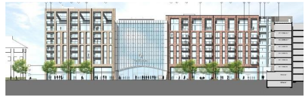
Height: Development façade (part) alongside existing Ranger House

What do ten storeys and 360 metres look like? Imagine you're across the Thames, looking at the