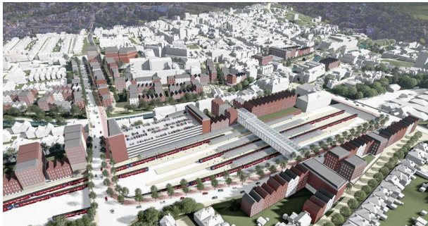
New look Station hub – from GVG Masterplan

We need a new transport hub and interchange at the station. Not just a new booking hall.